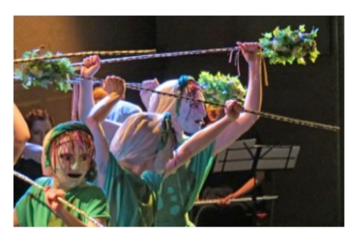
The Chorus of Bacchants dance.

The fact that the full production was in rehearsal for only three and a half weeks before the performance opened in front of a paying audience is staggering. Its success in drilling fourteen people who have never worked together as a masked ensemble into a team functioning at such a high standard is a great compliment to the working methods of the director and the rest of the creative crew. By comparison,