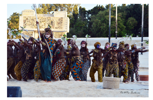
Choir of Danaids in Aeschylus's The Suppliants.