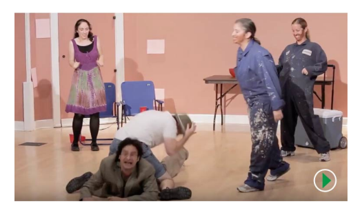
Persa in sung Latin