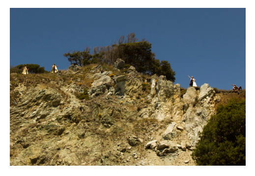
Image 10: A divine council meets atop the quarry.