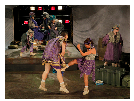
Company of LYSISTRATA.

standing government-supported theatrical programs, such as Theater of War and Ancient Greeks / Modern Lives, have used staged readings of Greek drama to facilitate dialogue