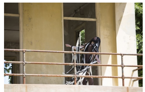
Image 17: Spirits of the dead inhabit the abandoned upper stories of the Post Hospital.

the expedition walked ahead to a musical performance in a church at Fort McDowell.