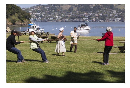
Image 2: Games, Servants, and Suitors at Ithaka.

transitions—not only between performance spaces, but also between performance modes. Each scene had its own distinct character and mood, ranging from more or less traditional static theatrical performance to voyeuristic encounters with tableaux vivants , anthropological observations of bizarre ritual, and moments of hands-on participation reminiscent of children's theater.