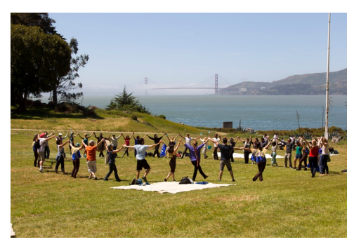
Image 7: Actors and audience dance together in the round in Aiolia.