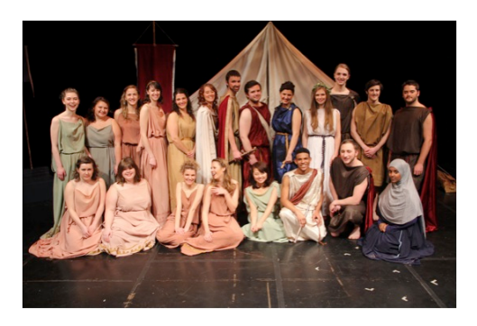
The CDG cast of IPHIGENIA AT AULIS