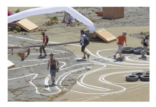
Image 13: Stuck between a rock and hard place: heroic crew members face Scylla and Charybdis.