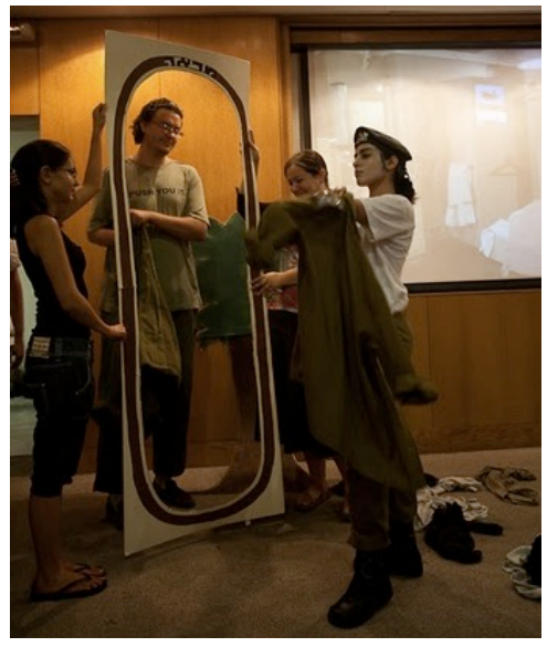
Figure 4: The Mirror

Over the last decade, interest in classical reception has spawned various sub-disciplines, one of which is performance reception. When, in the spring semester of 2009, I taught a course entitled "Ancient theatre workshop" at Bar-Ilan University in Israel, I seized the opportunity to focus on the actual production and staging of ancient drama, and to work with an example of such reception. The course was open to all students, both classicists and those with no background in the subject seeking a "general" course, and the aim was to produce a play to be performed at the end of semester. Writing and producing this play therefore provided an opportunity to witness at close hand how a group of 21st-century Israeli students interacted with and received ancient performance in creating their own modern drama.