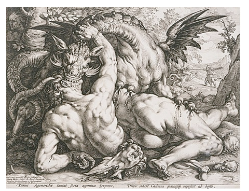
Plate 2: 'The Dragon Devouring the Companions of Cadmus' (line engraving, 25.1 x 31.5 cm)

Sontag's contemplations on the photographic image , from her groundbreaking work, On Photography (1977), to her last monograph, Regarding the Pain of Others (2003), clearly and intimately reflect her view of the world and her activism in particular. By living an intellectual life that regarded the pain of others, particularly those living with war, it is clear that Sontag's controversial decision to direct Samuel Beckett's Waiting for Godot in Sarajevo in 1993 was a manifestation of personal and political agendas, a response to a personal (and, natura lly for Sontag as a writer, public) involvement in war and its photographic record. At the time of the staging, Sarajevo was under siege by Serb forces, the theatre was in ruins owing to previous mortar attacks, and the audience attended at its peril. Accordingly, the production represented a new paradigm concerning the role of, and moral imperatives